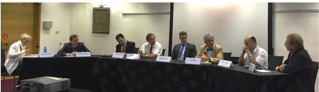
30 th Scientific-Legal Roundtable in Jerusalem, Israel, 2015