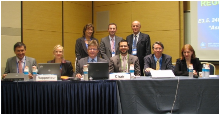
Scientific-Legal Roundtable 2009, Daejeon, Korea

Roundtables. The Liaison Committee is confident that in the future also, relevant and even exciting topics will be picked and that invitations to speak at a Roundtable will continue to be seen as an attractive slot in the IAC programme. With this, the Roundtables can be expected to continue to provide useful input to further the benefits of space activities.